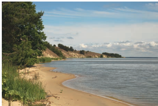
Curonian Spit

The project partners and associated partners include World Heritage sites and Biosphere Reserve Areas in the South Baltic region who face similar conservation, preservation and social challenges.